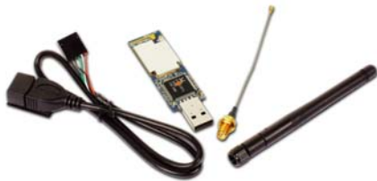
PN20 – Wireless LAN