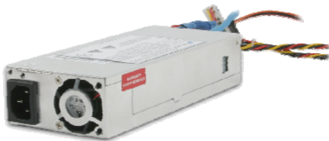
PC60 – 300W Silent-X Power Supply Top efficiency with 80PLUS label