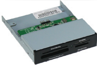
PC23 – 3.5” Card Reader