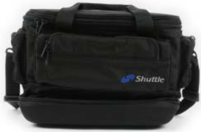
PF60 – Carrying Bag