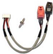
PC17 – Optical S/PDIF Output