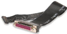
PC8 – Parallel Port Adapter